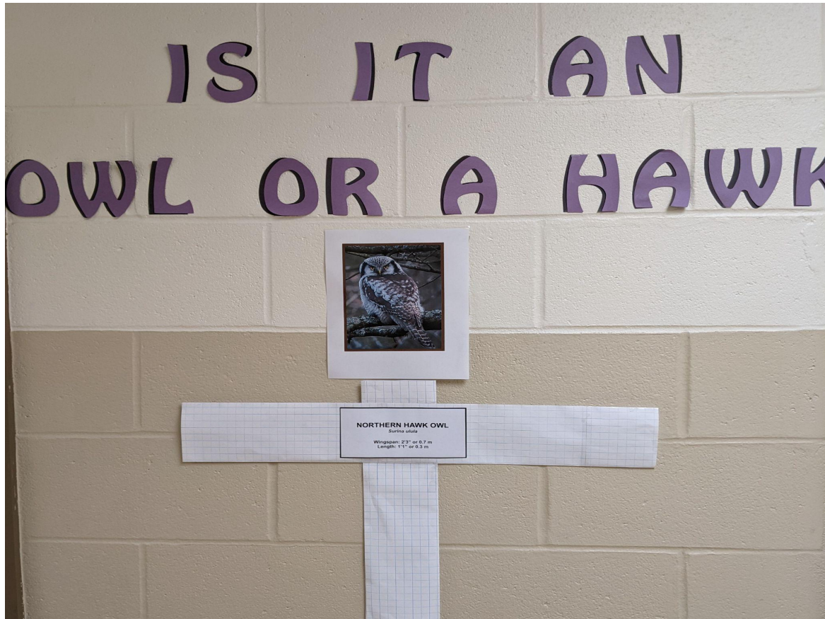
Our Feathered Friends