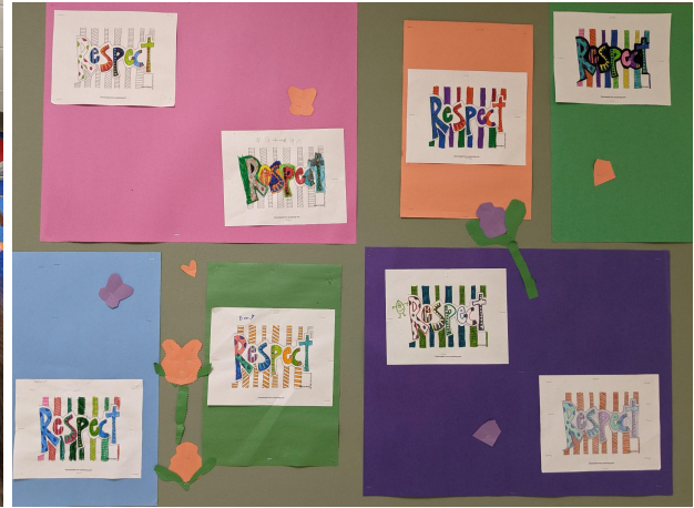
Our Respect Board