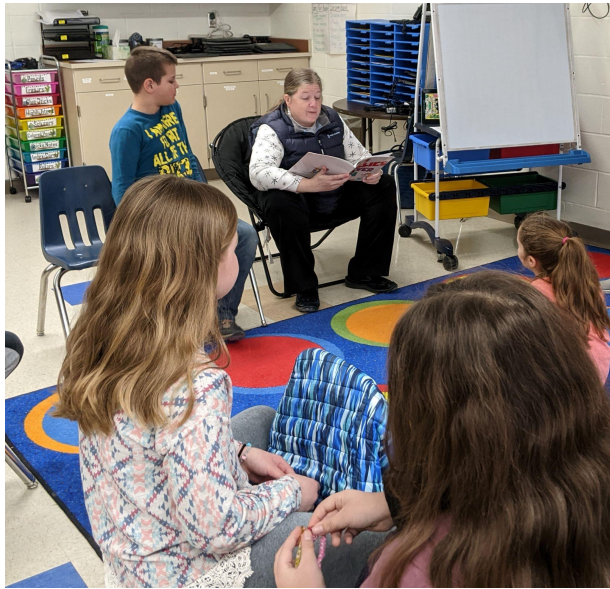
A lesson about bullying